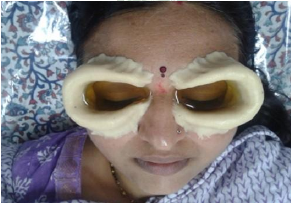
Picture 2. Tarpana with Jeevanti ghrita, female